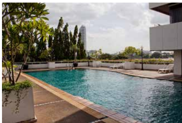
The pool at Juldis River Mansion.

Additional Info: Furnished with TV, fridge, aircon, wifi, phone, weekly cleaner, pool, private bathroom and kitchen.