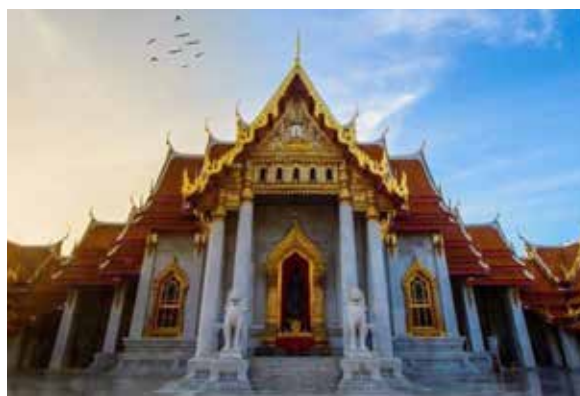
Wat Benchamabophit - 10min walk from UNESCAP

Because Bangkok has such a large culture of eating out, not all condos or apartments have kitchens. Many interns easily go without a kitchen but this is something to consider if you prefer to cook.