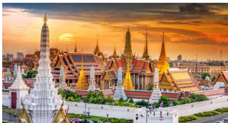
Grand Palace - 15 min drive from UNESCAP

Additional Info: Fully furnished, free shuttle to UN, many UN interns live here.